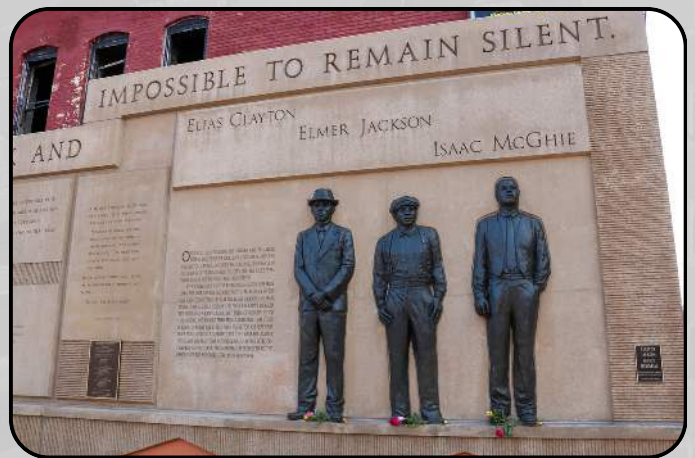
Clayton Jackson McGhie Memorial, Duluth