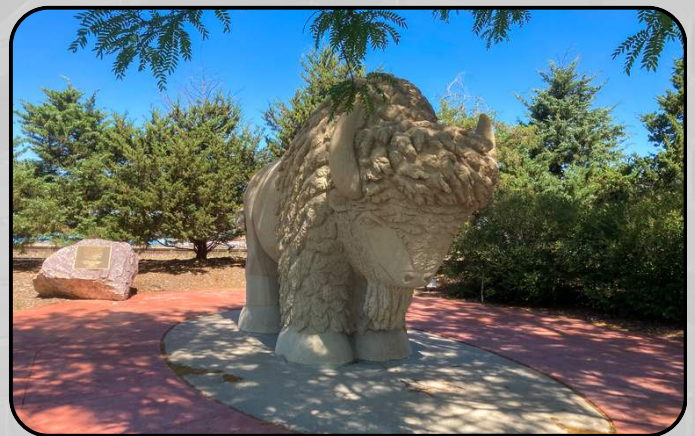
Reconciliation Park, Mankato