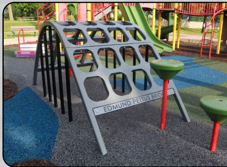
The playground structure at Rev. Dr. Martin Luther King, Jr. Park in Minneapolis' Kingfield neighborhood introduces new generations to the work of Dr. King and other local civil rights leaders with informational placards and interactive playground equipment.