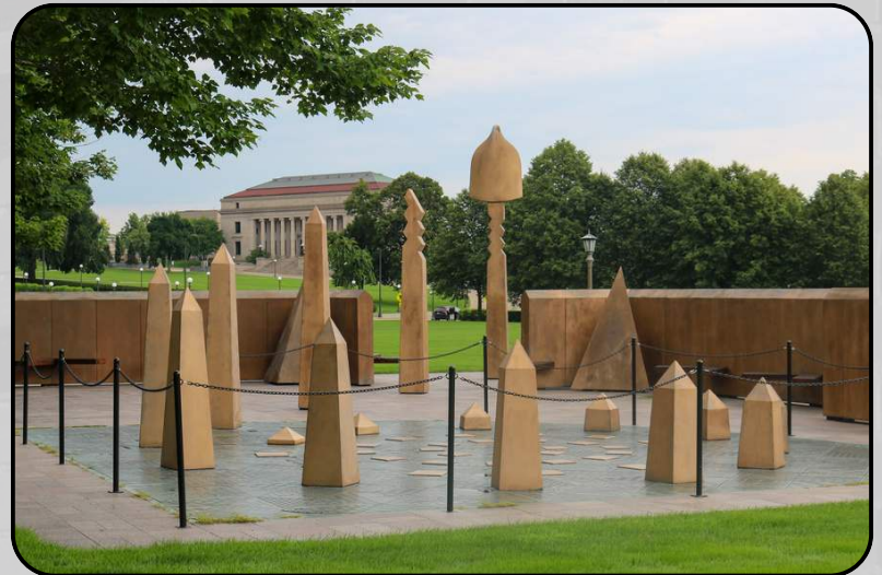
The Spiral for Justice on the Minnesota State Capitol Mall honors Roy Wilkins. The civil rights leader and former head of the NAACP grew up in St. Paul's Rondo neighborhood and attended the University of Minnesota.

Historical markers around Minnesota recognize the locations of numerous events from the history of our state. A list of more than 2,000 such markers spread across Minnesota can be found at the Historical Marker Database . Check out the list to find markers near you!