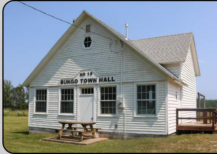
Bungo Township in Cass County is named for George Bonga. Born around 1802, Bonga the first known Black man to be born in present-day Minnesota.

Do you know about a site in Minnesota that has yet to be discussed? Fill out this form on our website to let us know about it, and it may be featured in a future Sankofa @ Home post!